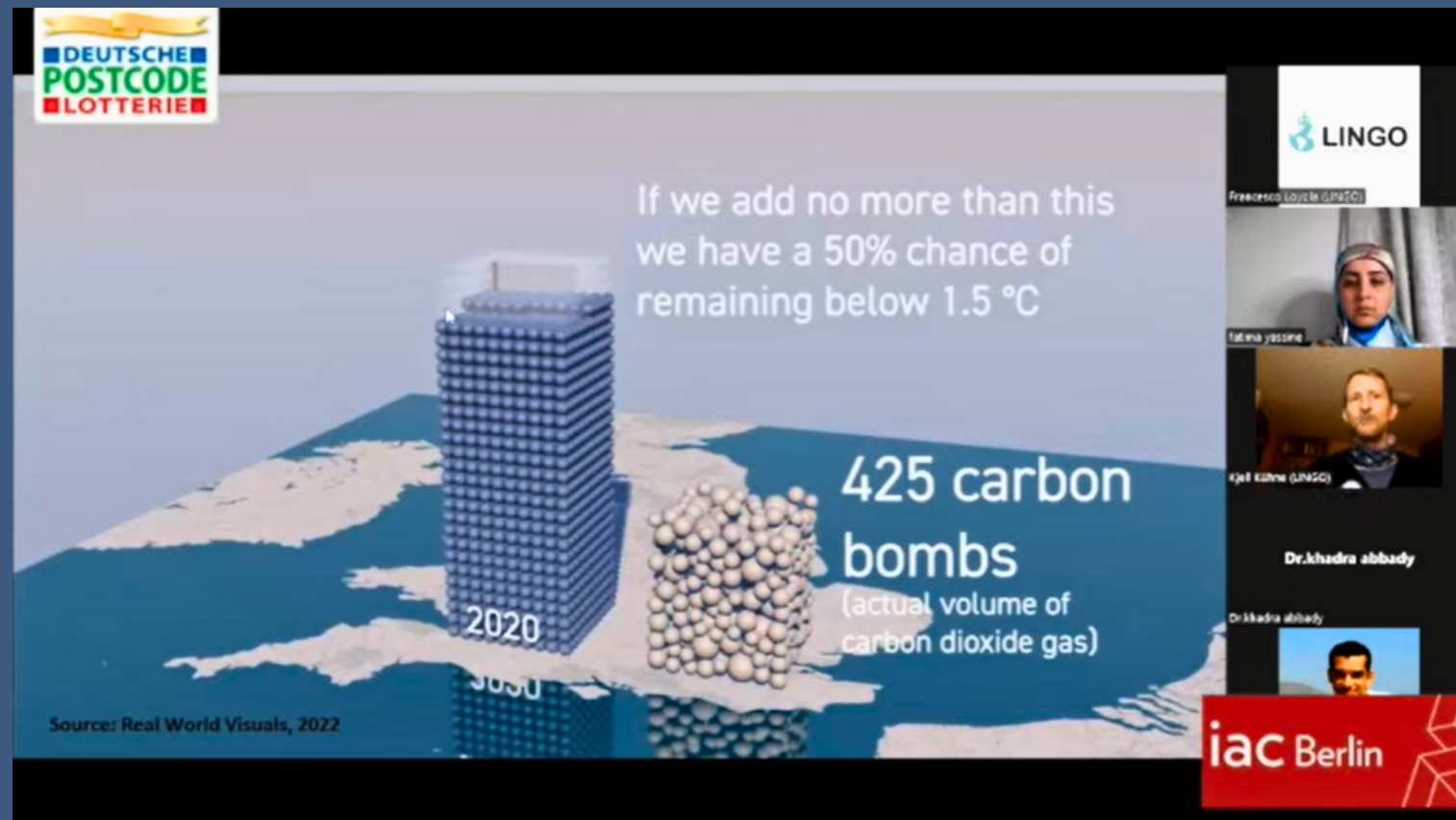
Webinar on Unburnable Carbon in Protected Areas in the MENA Region