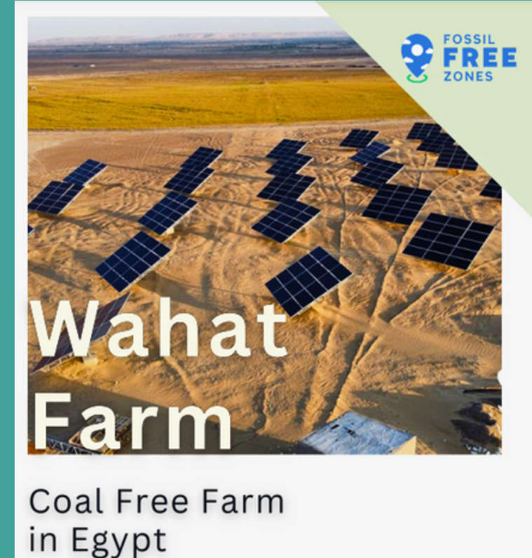
Cover pages of two case studies of existing emerging Fossil Free Zones.